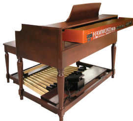
Easily Removable Upper Keyboard (XK-3c)

Introducing the Hammond Mini-B Organ-the spitting image of the legendary B-3, with all the key features found on our B-3mk2 organ like Custom Digital Tone Wheels, Harmonic Drawbars, Chorus Vibrato, Touch Response Percussion, and reverse color Preset Keys. The Mini-B feels and plays just like the classic B-3 organ. With a three year limited product warranty included at no extra cost, the Mini-B is the right organ at the right price for you or your church. Make your dream come true today!